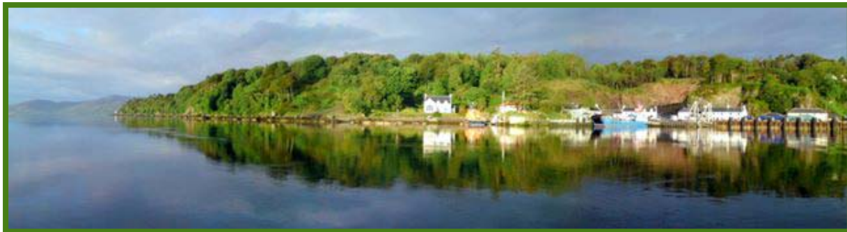
Port Askaig from the Sound of Islay