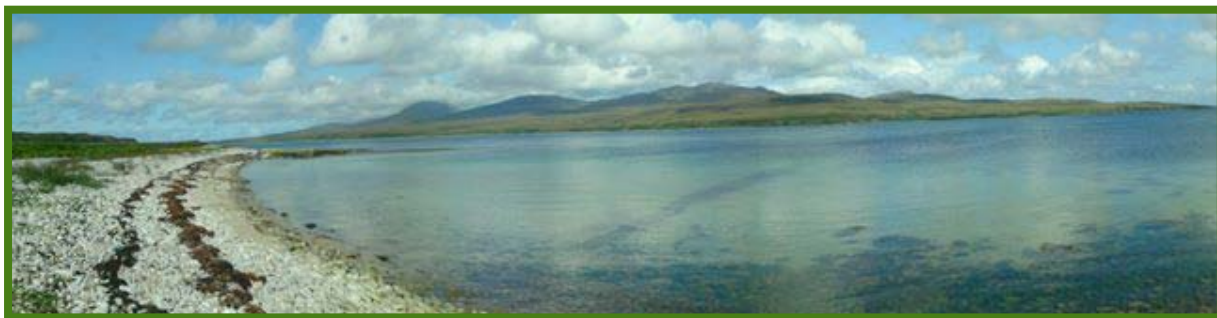
Jura and the Sound of Islay